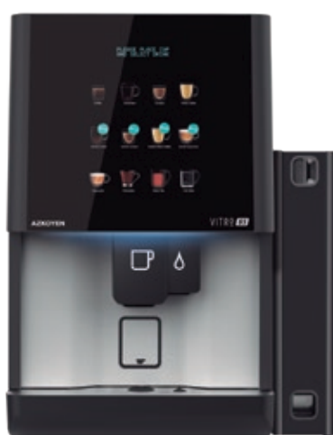
External MDB payment module