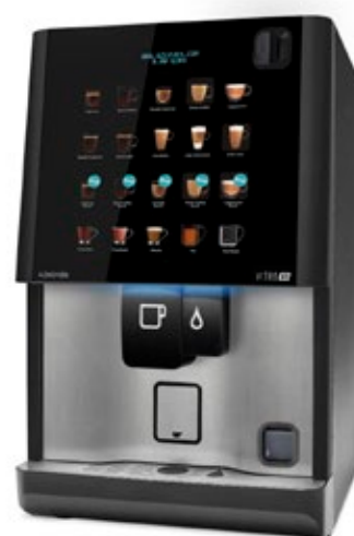
MDB change giver integration option