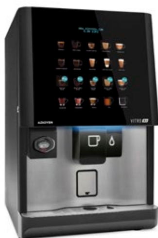
MDB cashless system integration kit

The machine is compatible with Pay4Vend App, allowing payment directly from a mobile phone.