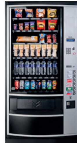
Palma+ H87 XtraDrinks