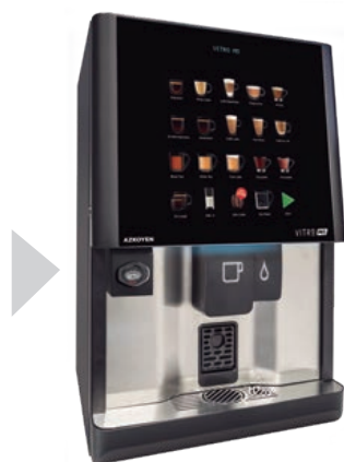
MDB cashless system integration kit

For stand-alone operation, the Vitro M5 allows the inclusion of a cashless system or a separate change giver pod. In addition, it is compatible with the Pay4Vend application that allows payment to be made directly from a mobile phone.