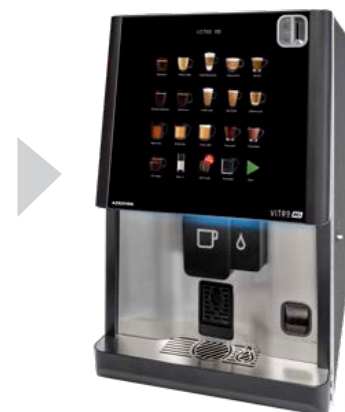
External MDB payment module