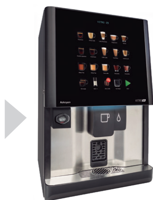
MDB cashless system integration kit

For stand-alone operation, the Vitro S5 MIA allows the inclusion of a cashless system or a separate change giver pod. In addition, it is compatible with the Pay4Vend application that allows payment to be made directly from a mobile phone.