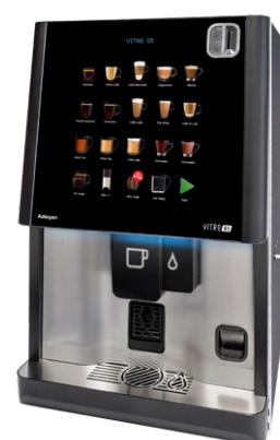
External MDB payment module