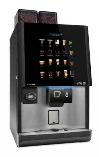
Cashless system integration option

The machine is compatible with Pay4Vend App, allowing payment directly from a mobile phone.