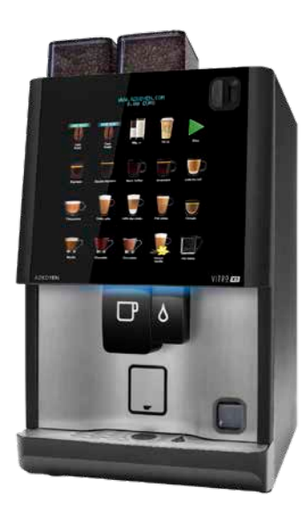
EXE/MDB change giver integration option