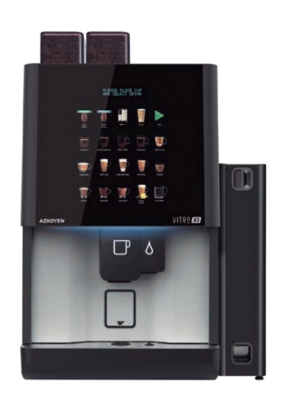
External EXE/MDB payment module